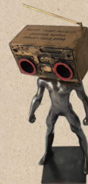
RADIO HEAD AWARD

Lonely Melody - Radio_Head Award 2014, I Like That - Esprit Public Price 2018.